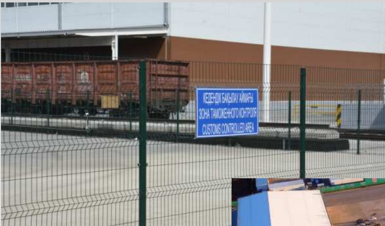
OPEN-AIR CUSTOMS WAREHOUSE 2500 m 2

An important element of the complex is the customs control zone with a customs warehouse and temporary storage warehouses.