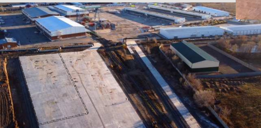
TEMPORARY STORAGE WAREHOUSE No. 3 2700 m 2