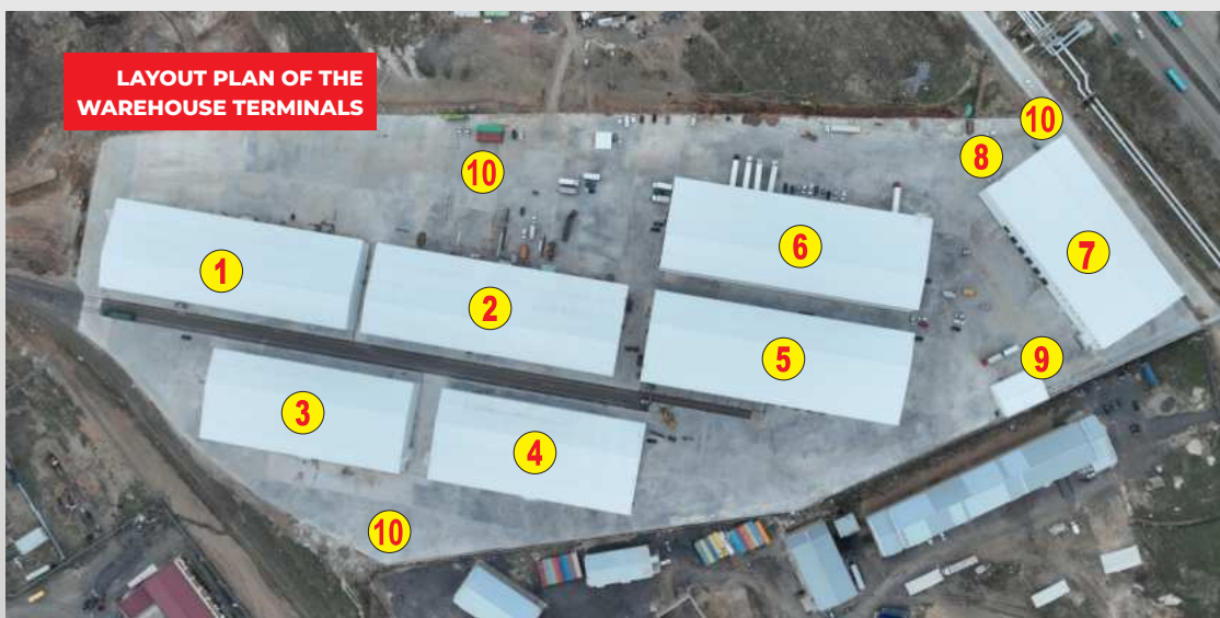
LAYOUT PLAN OF THE WAREHOUSE TERMINALS

NEW WAREHOUSES FROM 4000 M 2 ARE AVAILABLE