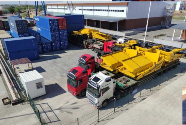
TEMPORARY STORAGE WAREHOUSE No. 2 2500 m 2