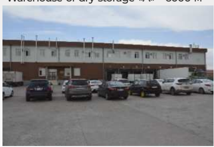
Warehouse of dry storage «А» - 6000 м²