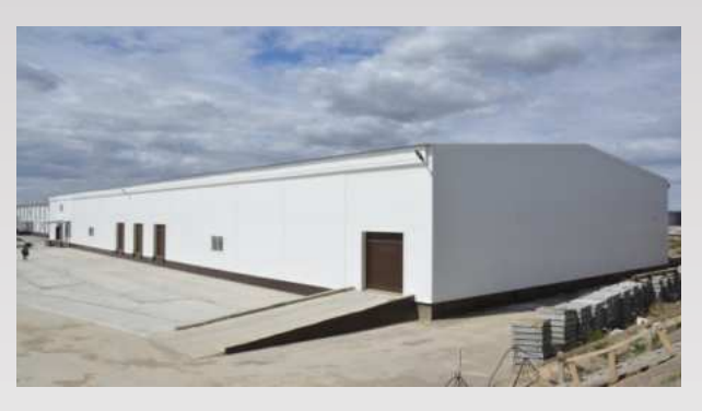
Warehouse terminal No.2 - 2500 m<sup>2</sup>