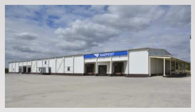
Warehouse terminal No.1 - 3000 m<sup>2</sup>