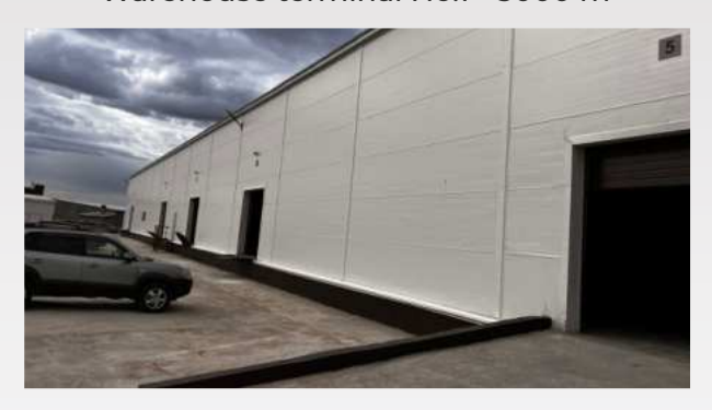
Warehouse terminal No.3 - 3200 m<sup>2</sup>