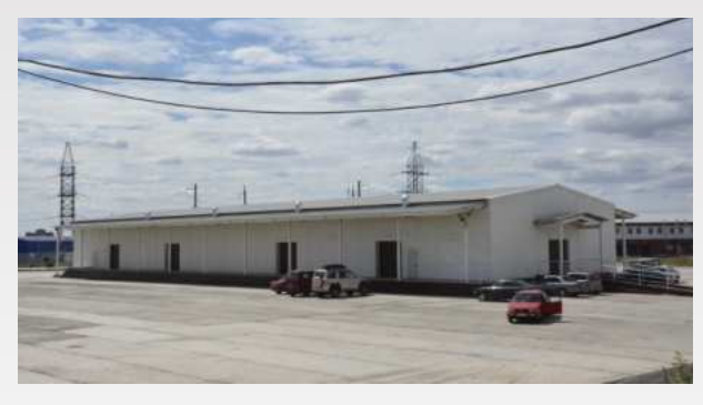
Warehouse terminal No.4 - 1500 m<sup>2</sup>

Multifunctional terminals are well suited not only for storing goods, but also for arranging a warehouse store or marketplace warehouse.